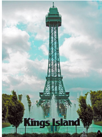
Kings Island's beautiful International Street entrance.

“This is the listening test. Part One. You will hear the recording twice. You will hear someone speaking about an amusement park. For each question, answer A, B, C or D .Now you will have twenty seconds to read the questions. Now we are ready to start. Listen carefully.”