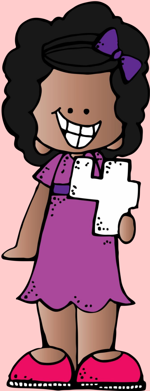
Tabla del 4