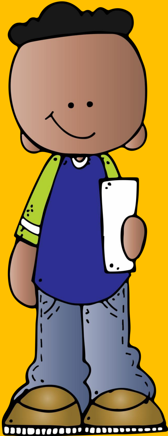
Tabla del 1