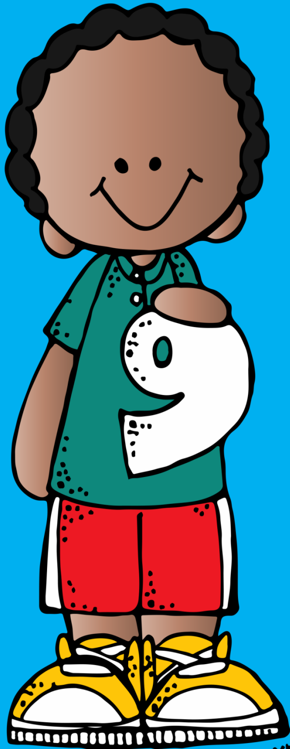
Tabla del 9