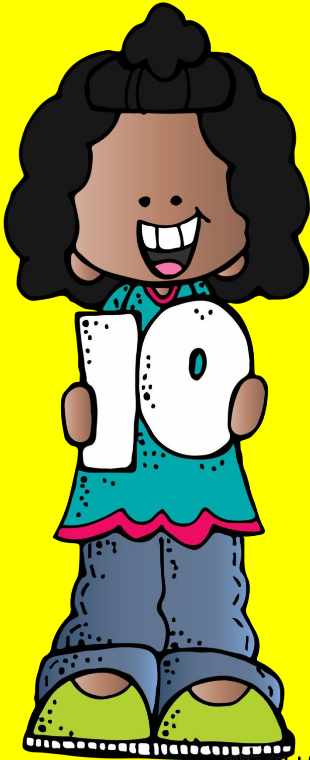
Tabla del 10