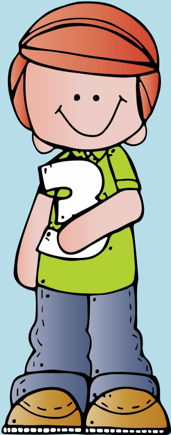
Tabla del 3